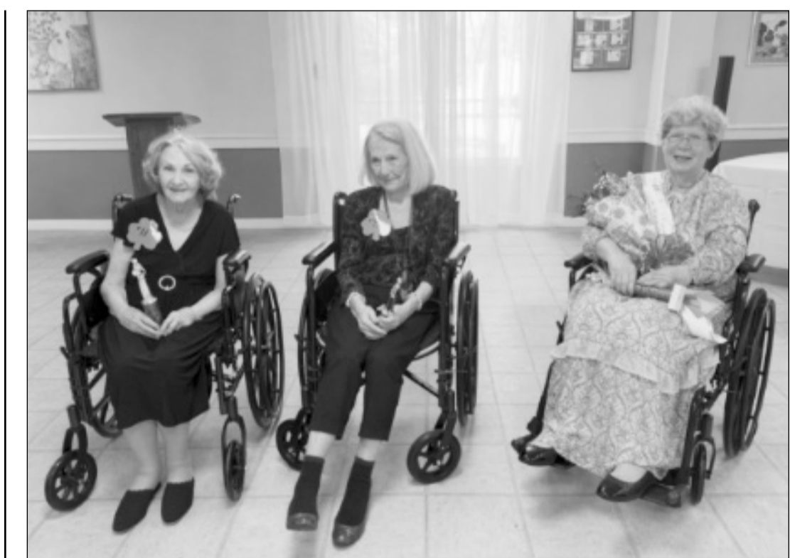
Winners from the Ms. Dublinair 2026 Beauty Pageant/SPECIAL PHOTO

The amount paid for property taxes depends on two variables: the tax rate — called a millage rate — and property valuation. Cities, counties and schools could simply bump the tax rate