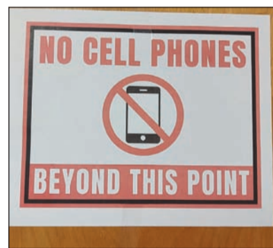
A sign on a courtroom door announces the new no-phones policy

The following are exempt from the ban on electronic devices in the