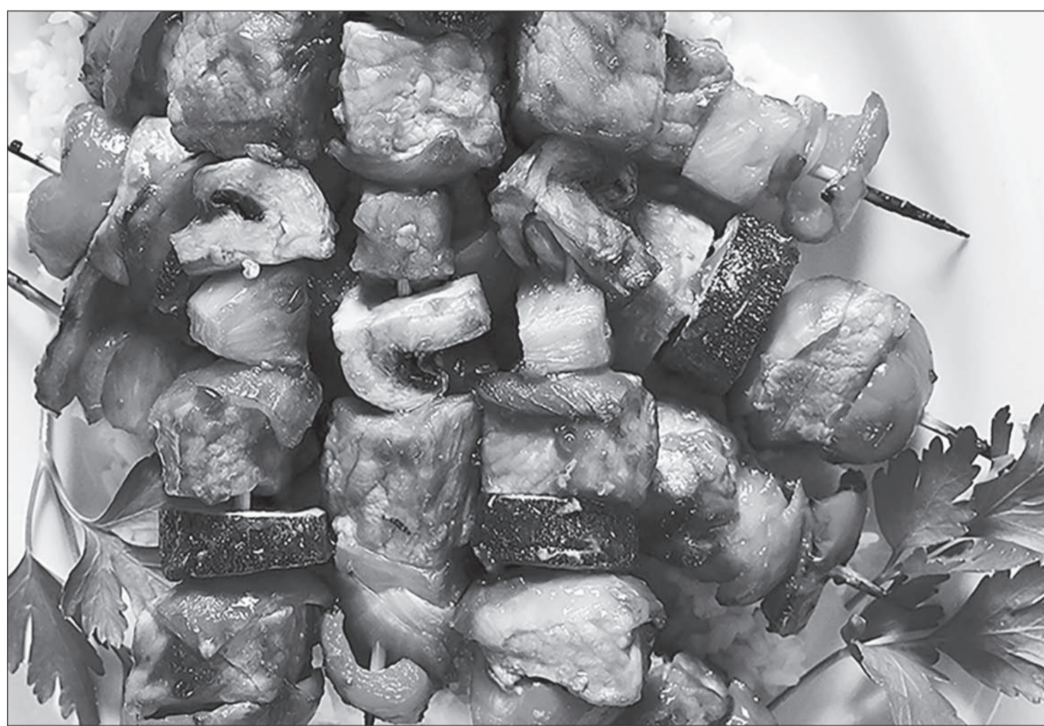
Tender pork, sweet pineapple and colorful vegetables are brushed with a homemade teriyaki glaze