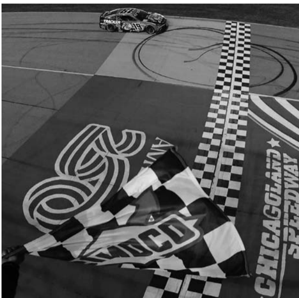
Chase Briscoe, driver of the #19 Bass Pro Shops Toyota, takes the checkered flag to win the Cup Series eero 400 at Chicagoland Speedway on Sunday.

The race was barely two corners old when a chain-reaction wreck sidelined star-crossed rookie Connor Zilisch. John Hunter Nemechek's Toyota forced the Chevrolet of Ricky