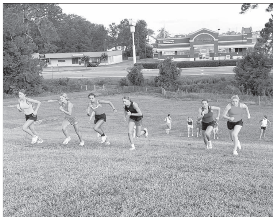
Climbing "Mount VA" after sunrise Tuesday