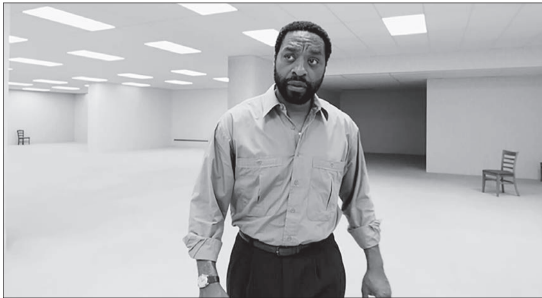
Chiwetel Ejiofor stars in "Backrooms"

"The Five-Star Weekend" (TV-MA) -- Jennifer Garner ("The Last Thing He Told Me") leads this heartwarming drama miniseries that drops on July 9, and