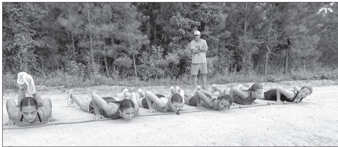
Following their initial run of Scooter Rue Road, players were treated to some lagniappe (a little, unexpected something extra) in the form of these burpees on the way back home

Is there an activity that any, besides those who en-