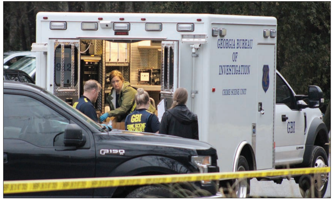
GBI agents work the scene in the Ponderosa trailer park on Jan. 30, 2023 where an East Dublin police officer was grazed by a bullet