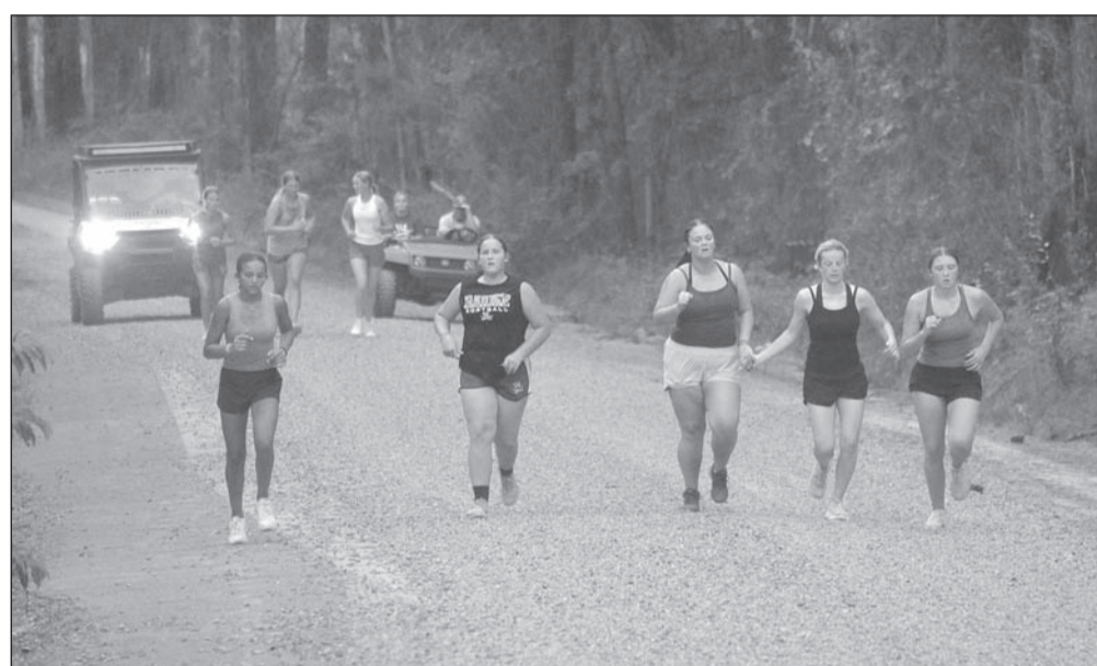
Raiders, with coaches in four-wheeled vehicles bringing up the rear, push down the home stretch of the "Scooter Rue" at twilight Tuesday evening

In past years they've run it carrying weights, divided into teams or as a large group. At least a few times, it's been divided into sections with some surprises waiting