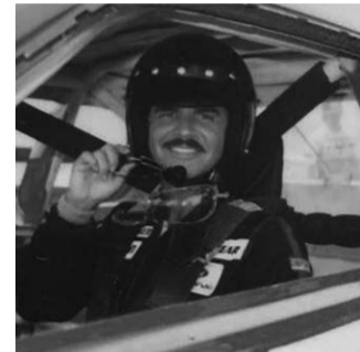
Burt Reynolds in 'Stroker Ace'