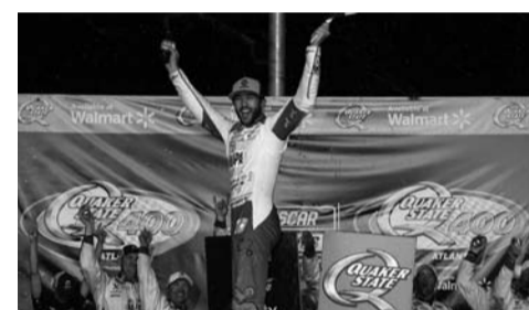
Chase Elliott, driver of the #9 NAPA/Children's Chevrolet, celebrated in Victory Lane last year after winning at EchoPark Speedway.